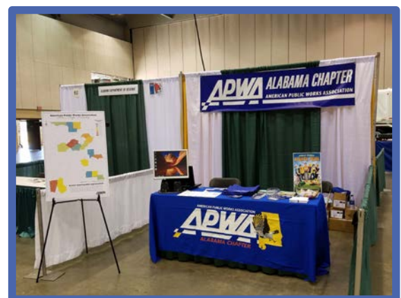
AL Chapter Booth before opening of Alabama League of Municipalities EXPO 2016

To be an active, unified Public Works organization, providing leadership, education, training, direction and support on Public Works issues to its members, elected officials, and the public, every day, as well as during times of natural disaster.